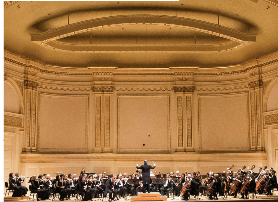
The CSO performs at Carnegie Hall in New York City in 2018..

In every sense, the Chicago Symphony Orchestra is an ambassador for the power of great music and the universality of live performance.